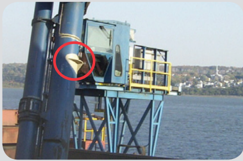
Installed detector on vertical conveyor