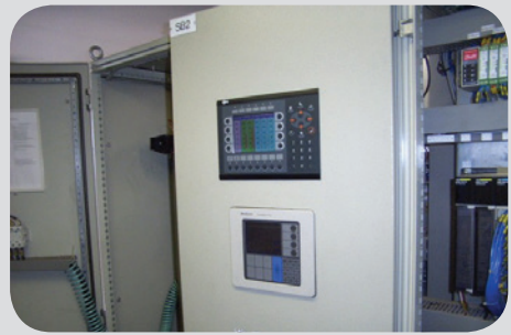
New graphic display on PLC