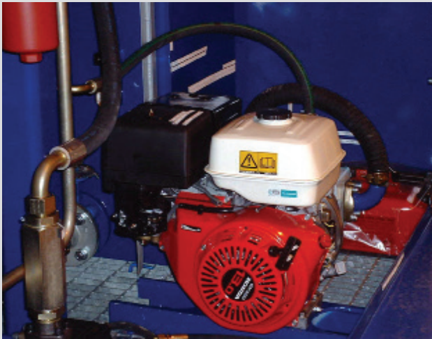
Petrol combustion motor