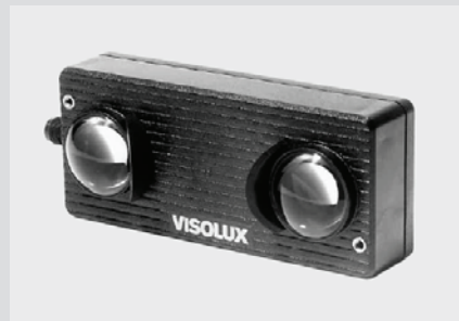
Light scanner type Visolux LT 6000

The sensing range for the light scanners is 0.5 - 6 metres. Also available are new control cables from the sensors to the existing control system (PLC system); revised PLC programme; and updated maintenance and operation manuals.