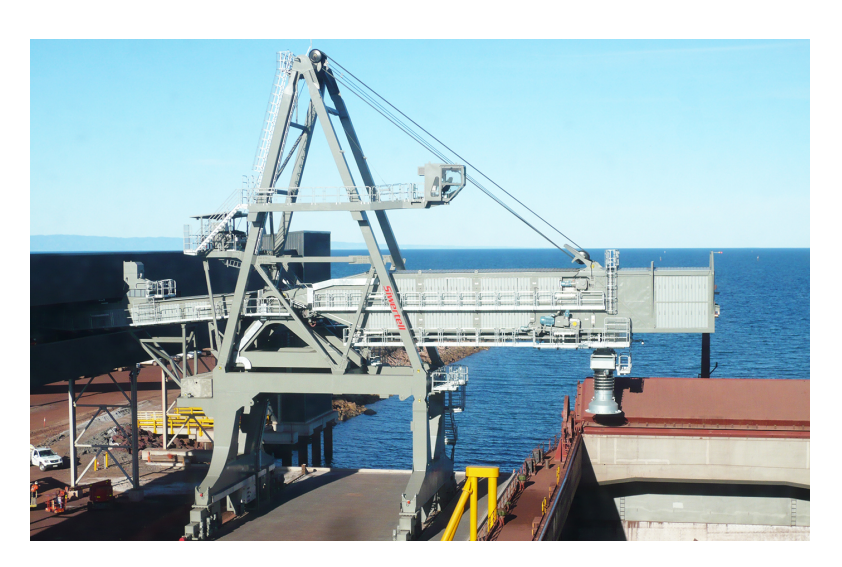
LINK TO CUSTOMER CASE